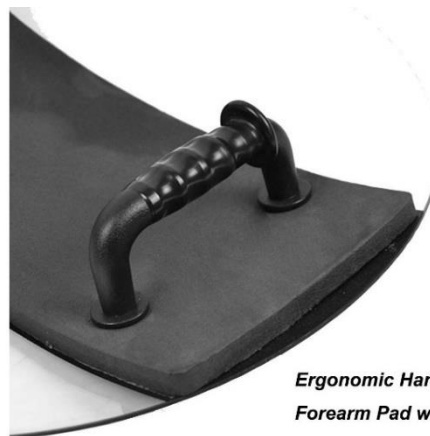
Ergonomic Handle; Forearm Pad with Shock Protection;